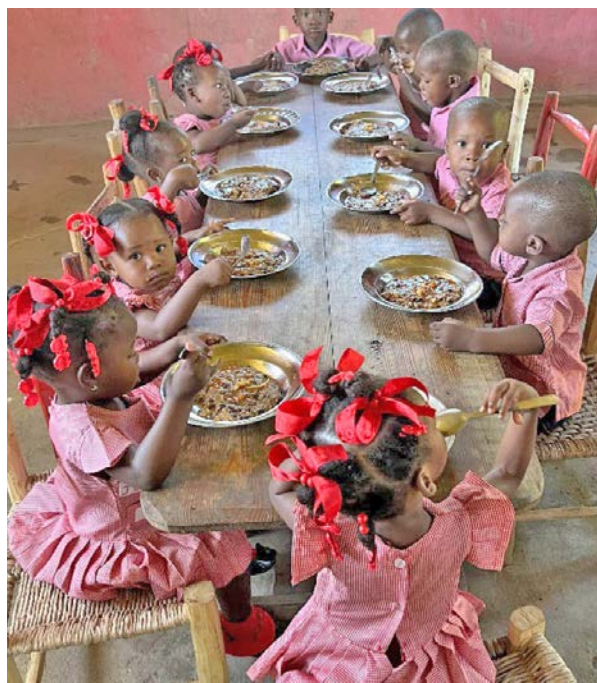
Feeding children in Lutheran schools in Haiti through Trinity HOPE is a district mission grant for the 2022-24 biennium.