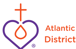
stacked vertical district