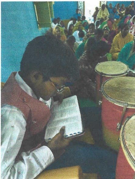
Congregational teen using the Bible to grow in faith.