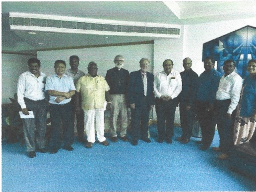
Meeting with Bible Society of India – For permission to use Biblical texts within India.